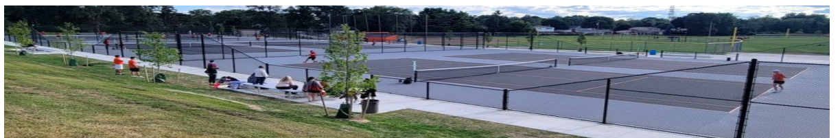
Renovated Utica High School tennis courts

To see a list of projects, please see this link: www.uticak12.org/2018bond/updates .